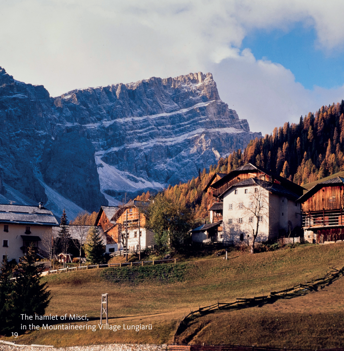
The hamlet of Misci, in the Mountaineering Village Lungiarü