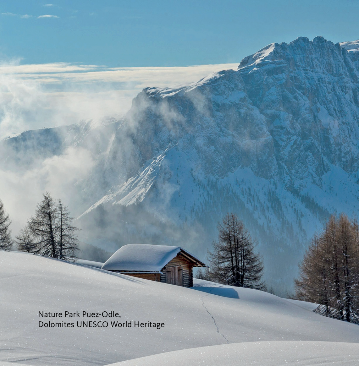
Nature Park Puez-Odle, Dolomites UNESCO World Heritage