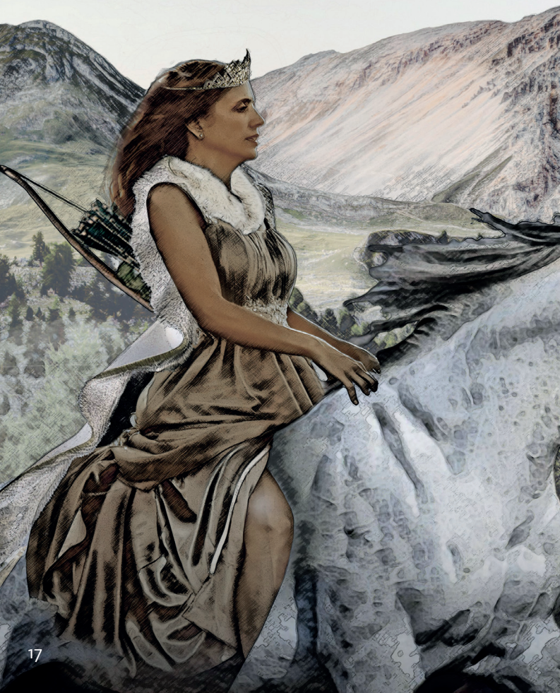
Princess Dolasilla, the war heroine in the Kingdom of the Fanes