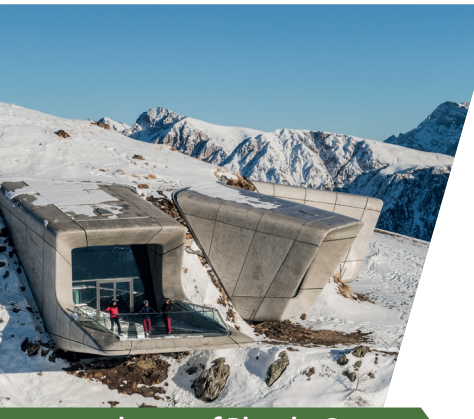
on the top of Plan de Corones