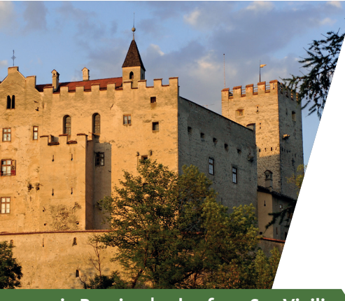
in Brunico | 17 km from San Vigilio